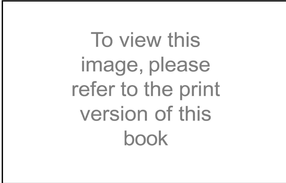
Fig. 15-1. Venturi vacuum system.