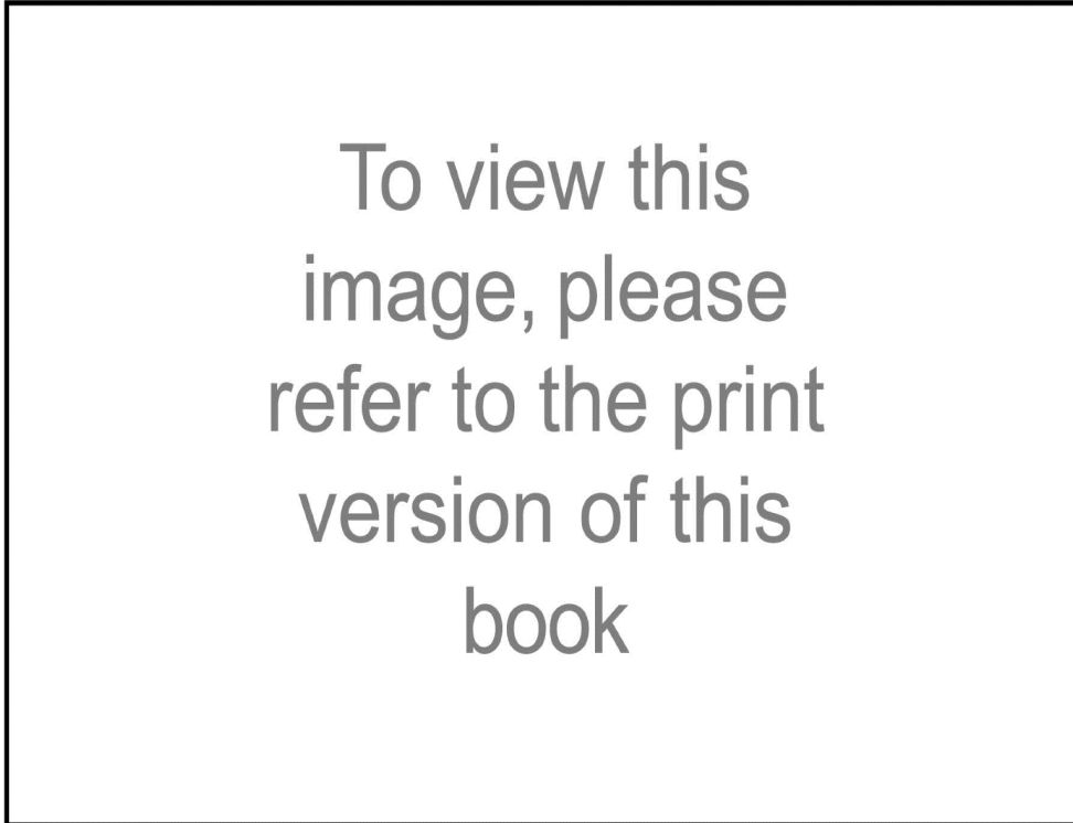
Fig. 2-3. Modern, two-aneroid altimeter.