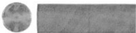
FIG. 1 Acceptable View of the Break Face.

8.1 The surface of the wire as received shall be smooth and generally free of rust. A light oxidation film that does not cause pitting of the wire surface visible to the unaided eye after wiping or light cleaning, shall not be cause for rejection. Coils of wire with visible pitting shall be rejected.