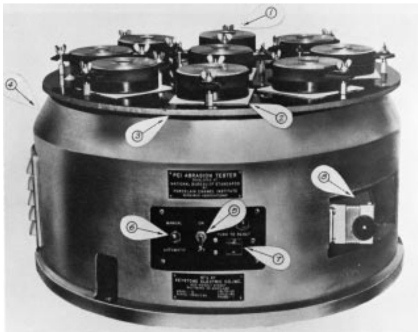
1. Rubber-lined retaining ring with accessory hole for introducing abrasive charge. 2. Test specimen. 3. Phenolic or aluminum top. 4. Aluminum housing. 5. ON-OFF switch. 6. Selector switch. 7. Circuit breaker button. 8. Automatic timer.

vertical shaft which transmits to it the horizontal circular motion required to cause every point on each specimen to