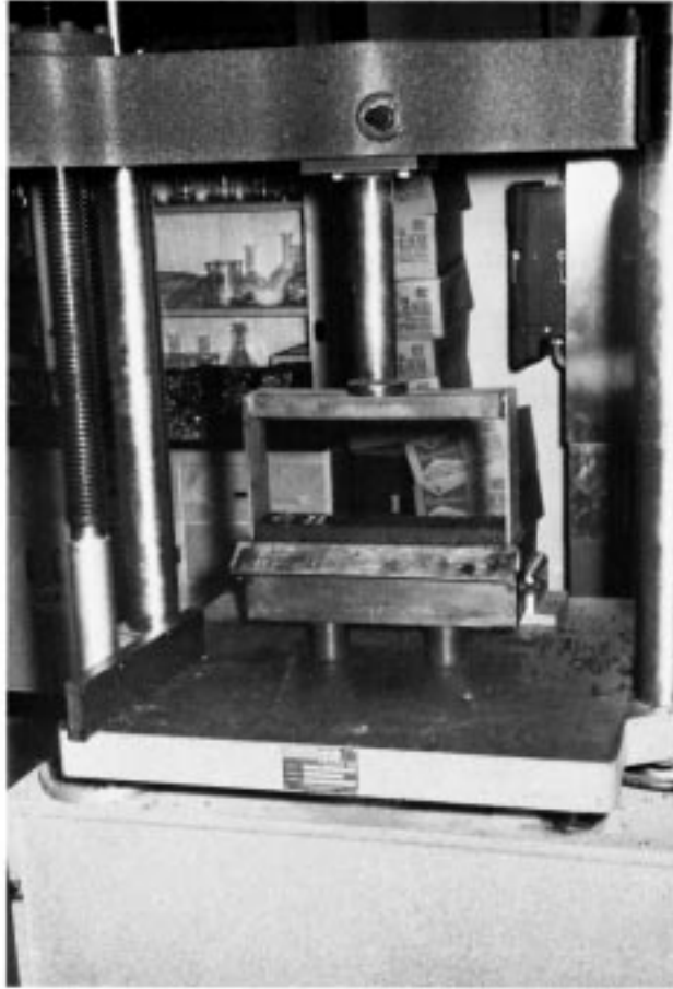
FIG. 2 Beam Extraction Assembly

ASTM International takes no position respecting the validity of any patent rights asserted in connection with any item mentioned in this standard. Users of this standard are expressly advised that determination of the validity of any such patent rights, and the risk of infringement of such rights, are entirely their own responsibility.