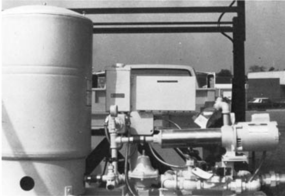
FIG. 2 Variable Speed Friction Tester Water System

specimens for testing, and collects the water from the nozzle for disposal.