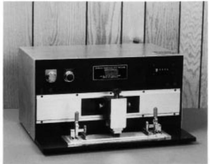
FIG. 1 Granule Adhesion Test Apparatus

4.1 Granule Adhesion Test Apparatus 2 —A machine designed to cycle a test brush back and forth horizontally across a specimen at a rate of 50 cycles for 60 to 70 s. The brush assembly rests on the specimen with a downward mass of 2268 \pm 7 g ( 5 lb \pm \frac{1}{4} oz); the stroke length is 152 \pm 6 mm ( 6 \pm \frac{1}{4} in.). A typical machine is shown in Fig. 1.