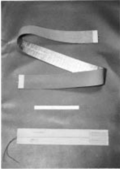
NOTE 1—Belt wraps around exterior; shim slips under jacketing (spot HFT).