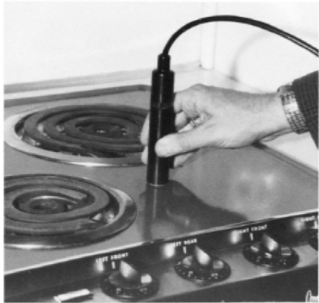
FIG. 3 Applying the Thermesthesiometer to a Horizontal Surface

8.1.3 The maximum hot surface temperature expected in Method A and its method of determination.