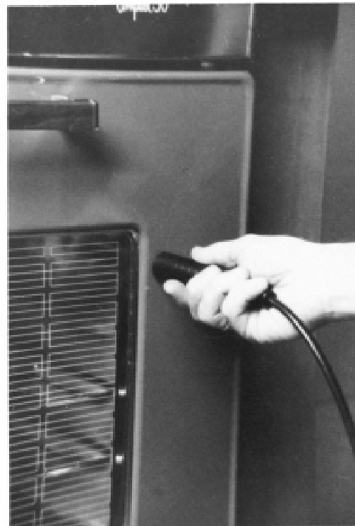
FIG. 4 Applying the Thermesthesiometer to a Vertical Surface

8.1.4 The design contact time of exposure.