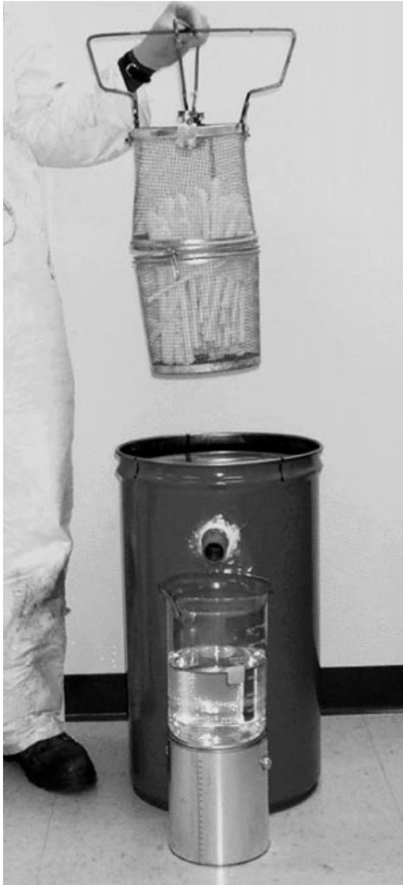
FIG. A1.2 Foam Beads In Cage Ready For Submersion In Water Tank