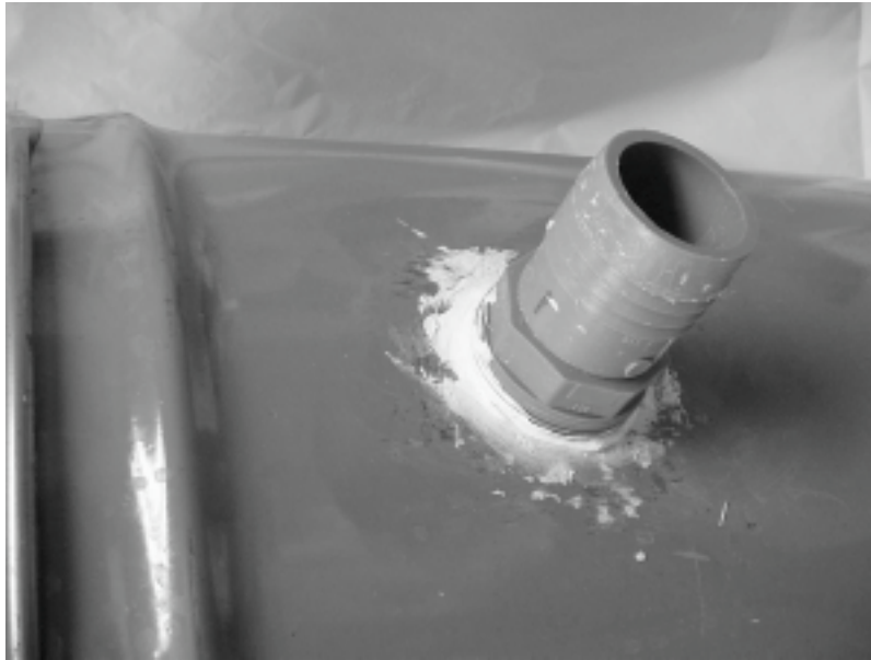
FIG. A1.5 Overflow Tube Detail