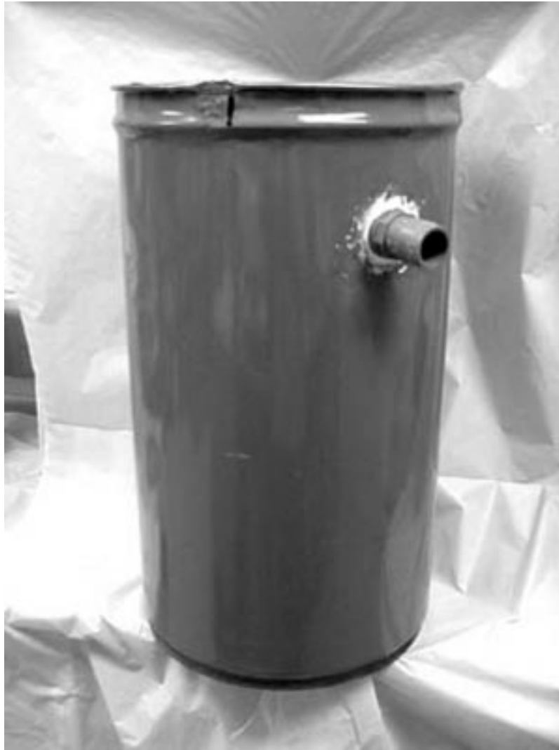
FIG. A1.4 Submersion Water Tank With Overflow Tube