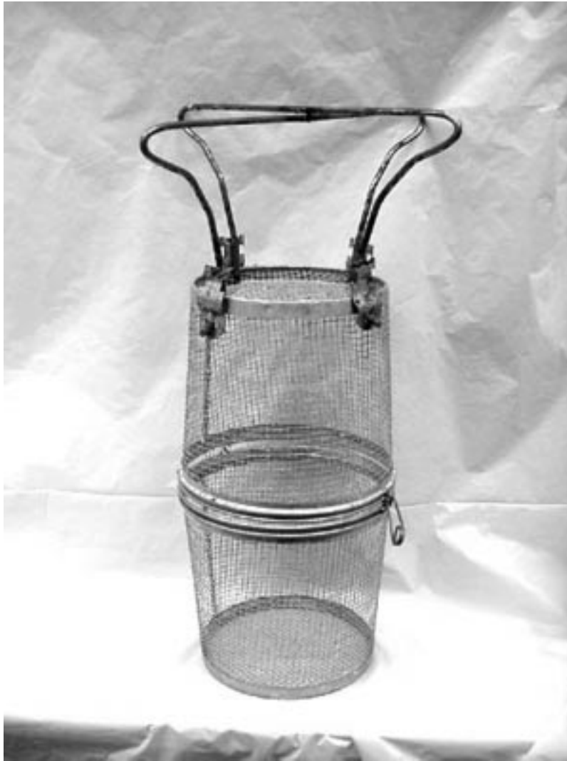
FIG. A1.3 Cage Detail