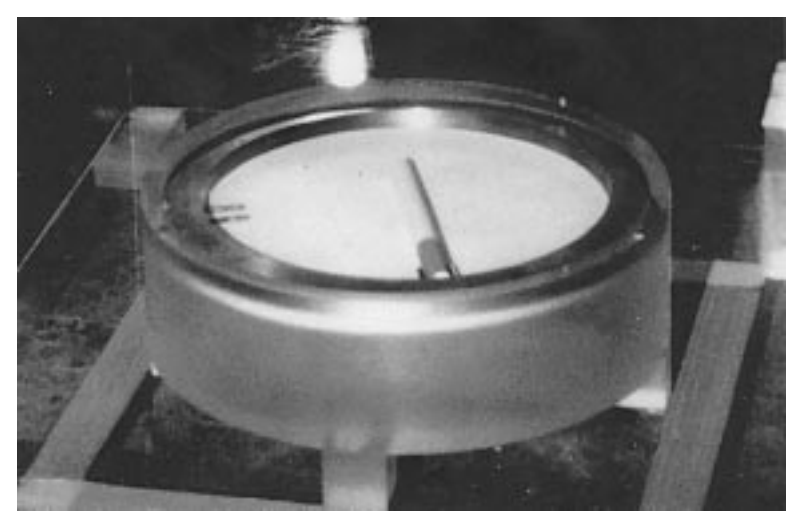
FIG. 2 Close-up of Test Cigarette, Filter Paper Holder, Metal Pins and Metal Rim

lit end of the cigarette. If turbulence is noted, then (a) the test chamber shall be checked for leaks, (b) the test chamber locations shall be evaluated for excess air flow in the laboratory, and (c) the air flow of the exhaust system shall be evaluated as the source of the disturbance.