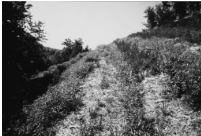
FIG. 4 Photograph of Live Fascines in the First Growing Season

shallower than the diameter of live woody plant material bundles. Temporarily stockpile excavated material on the uphill side of the trench. Any soil amendments, if needed, should be placed in the bottom and along the sides of the trench and mixed into the soil, before placing the live woody plant material bundles.