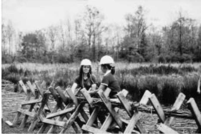
FIG. 1 Photograph of Live Fascine Fabrication (Tied Bundles, Not Installed)