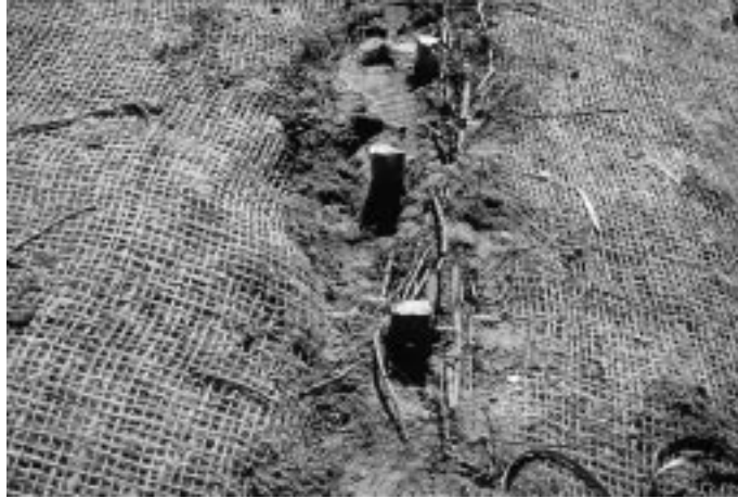
NOTE—A rolled erosion control product was also used in this example FIG. 3 Photograph of Typical Complete Live Fascine Construction