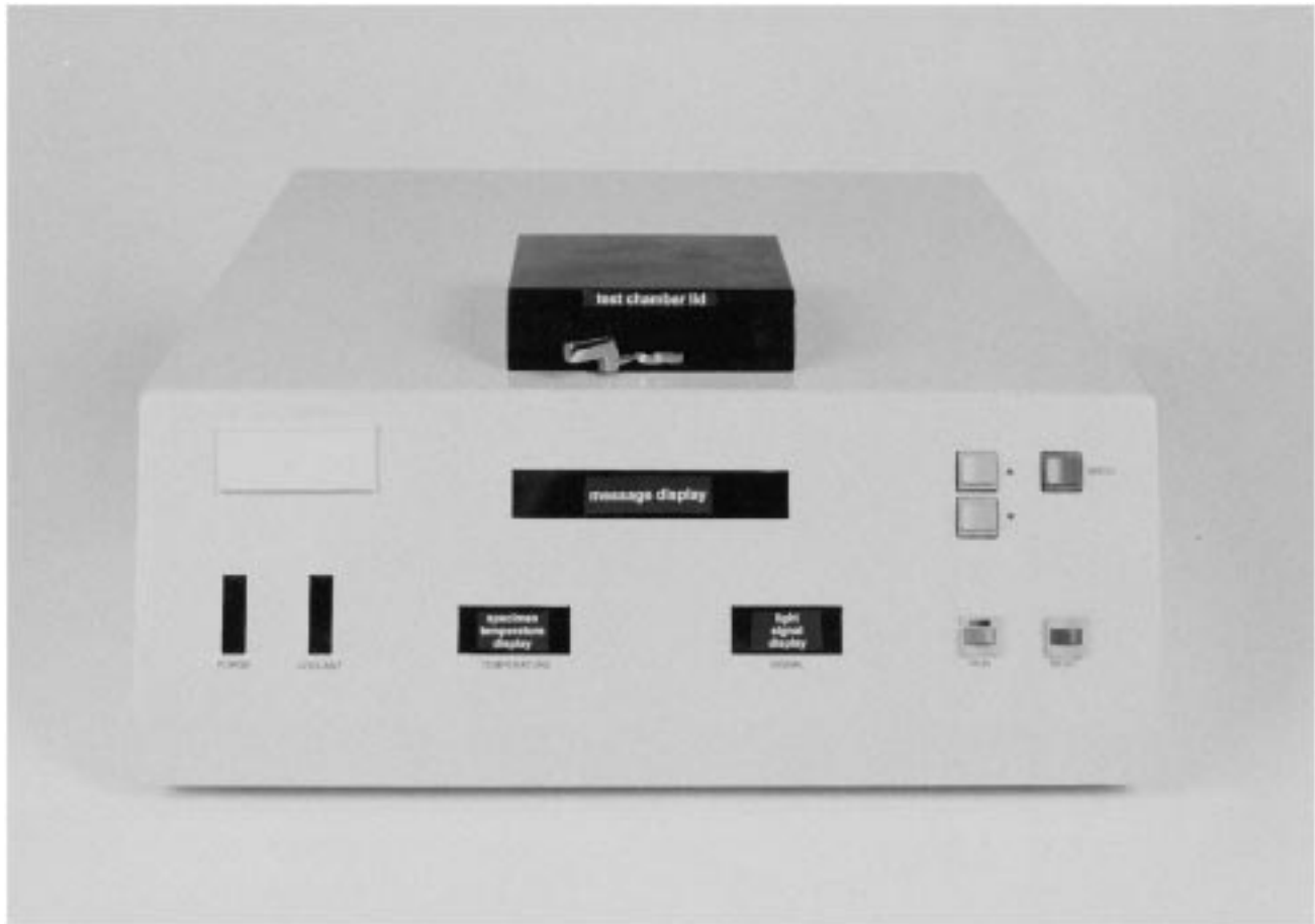
FIG. A1.3 Apparatus Exterior