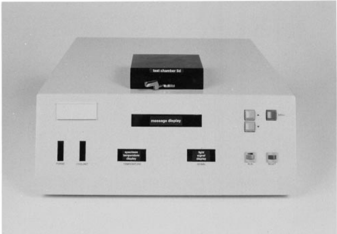
FIG. A1.3 Apparatus Exterior

A1.2.5 RUN Button , allows the operator to start the measurement sequence once the specimen is put inside the test chamber.