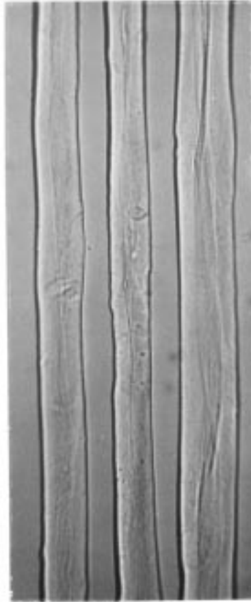
FIG. 3 1 Mature Fiber

3.1.7 micronaire reading, n —a relative measurement of fiber fineness derived from the porous plug air-flow method.