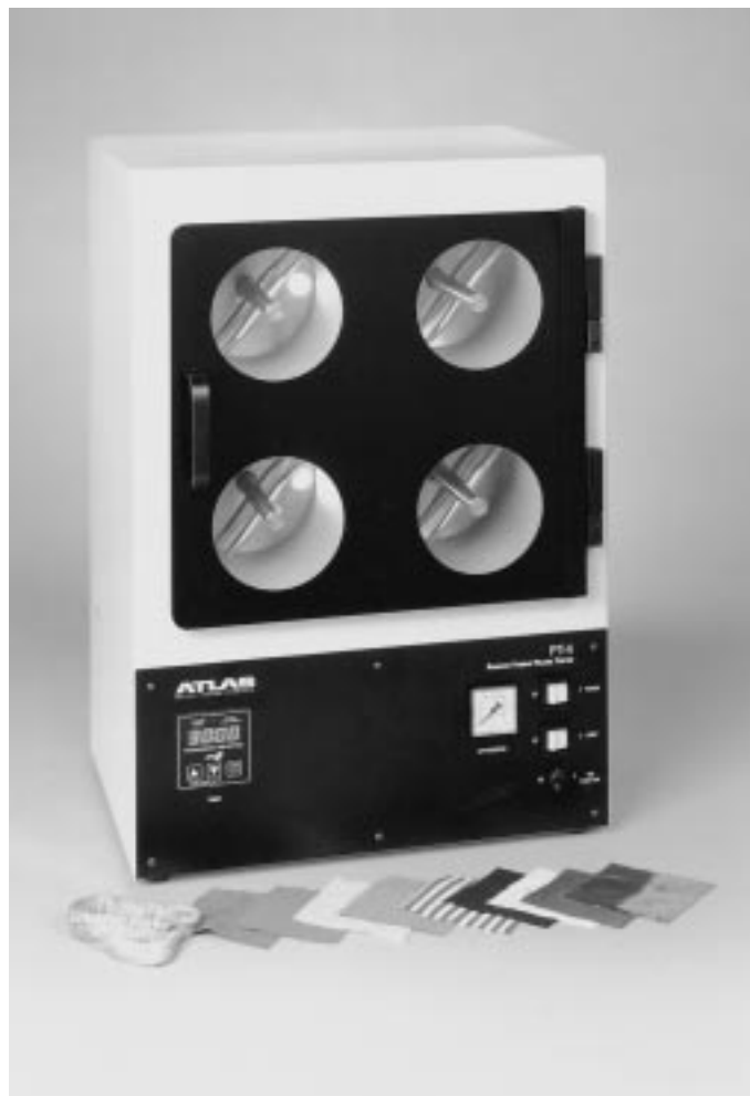
FIG. 1 Random Tumble Pilling Tester