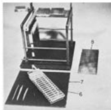
(Rear View) 5—Drawing clamp. 6—Depressor. 7—Plush board. 8—Faller bar lifting plate.