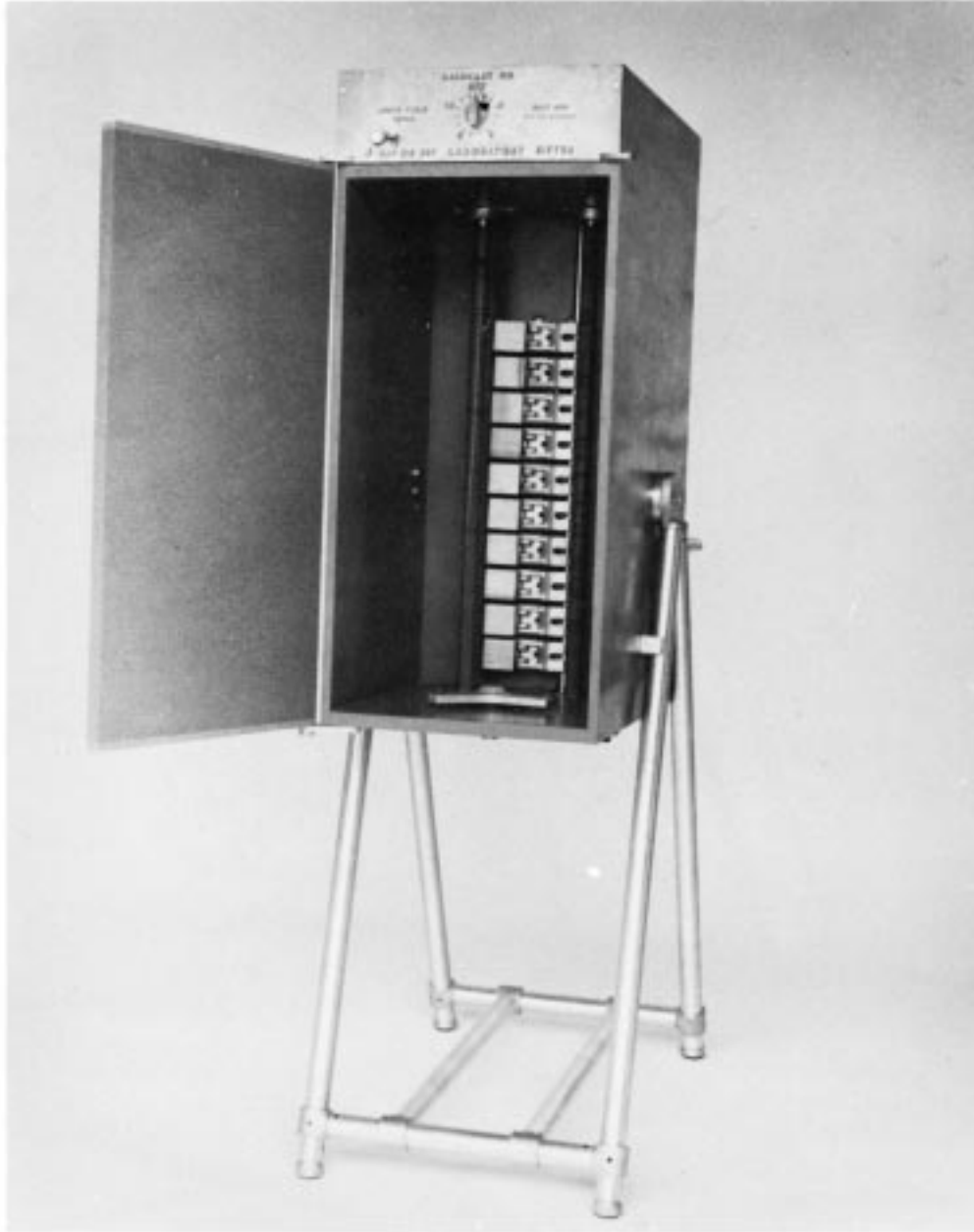
FIG. A1.2 Rotary Pan Sieve