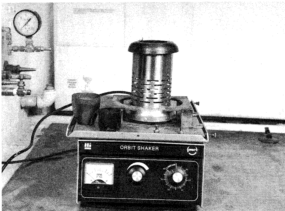
FIG. 1 Electric Bunsen Burner Mounted on the Orbital Shaker

are to be reagent grade. Unless otherwise indicated all reagents shall conform to the specifications of the Committee on Analytical Reagents of the American Chemical Society. 5