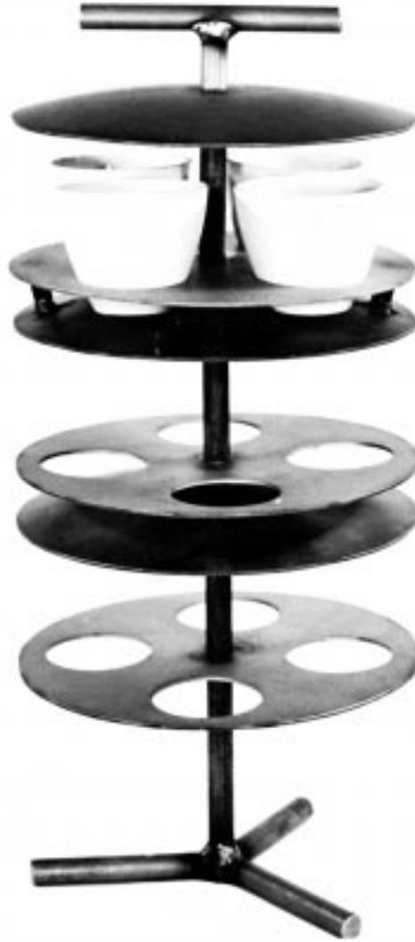
FIG. 2 Suitable Rack for Protecting Specimens from Drip or Condensate

5.5 Allow sufficient cooling to lower the autoclave to 20 to 30 psi (138 to 207 kPa) with the release valve closed, and then carefully open the relief valve to reduce the autoclave to atmospheric pressure in a total time between 30 and 60 min. Remove the specimens and examine them.