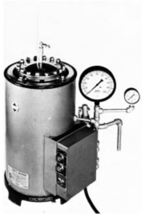
FIG. 1 Suitable Apparatus for Measuring Hydration Resistance of Basic Brick and Shapes (See 2 )

4.1 The test specimens shall be 1-in. (25-mm) cubes cut from the interior of basic refractory brick or shapes so that no original surfaces are present. Only one specimen shall be cut from each of five bricks or shapes.