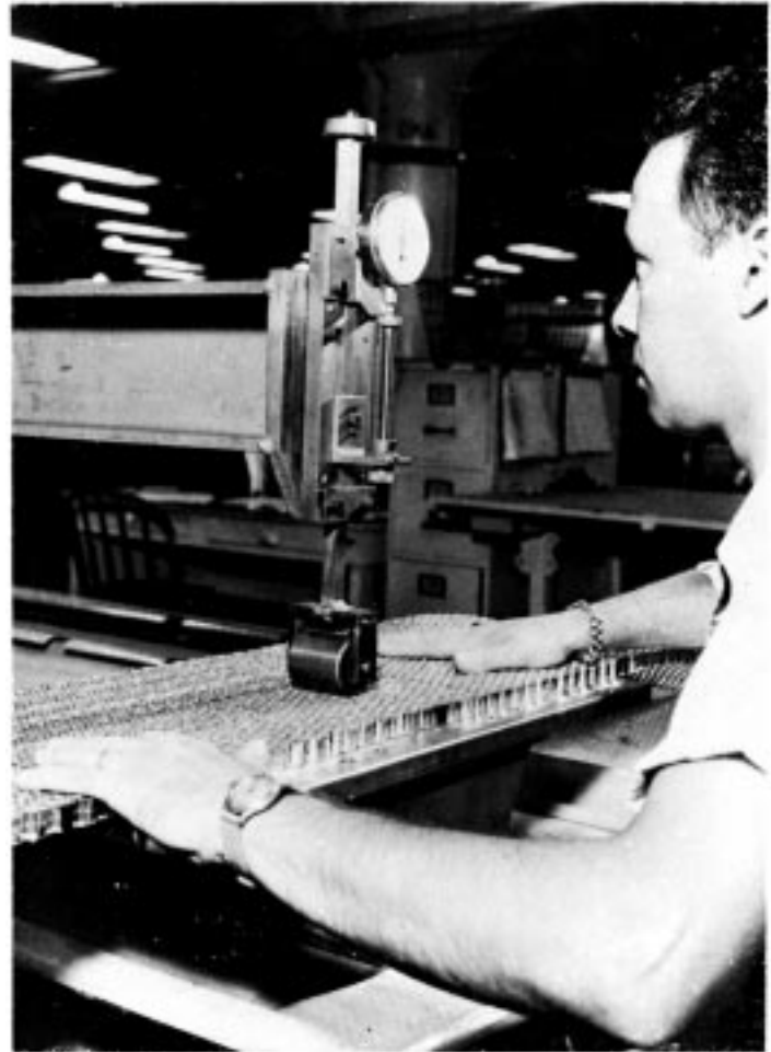
FIG. 1 Roller-Type Thickness Tester

3.2 Method B—Disk-Type Thickness Tester: