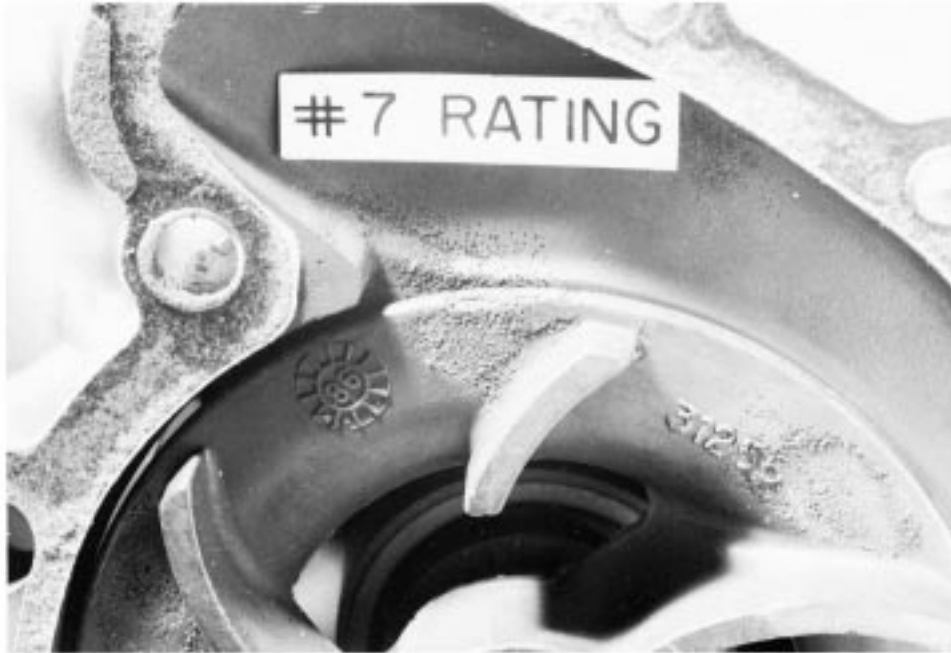
FIG. X1.2 Rating 7