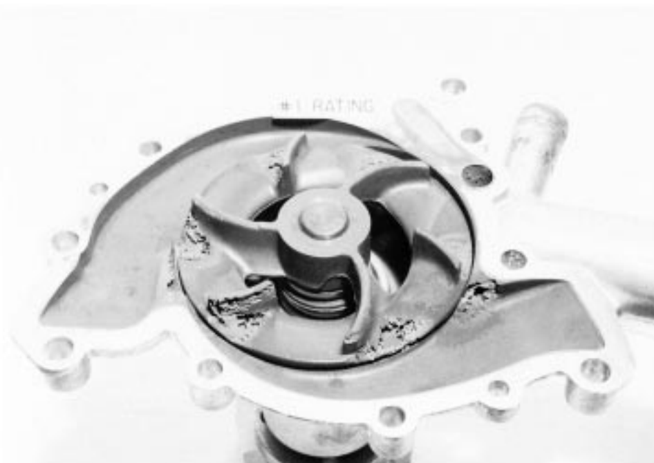
FIG. X1.1 Rating 1

This standard is copyrighted by ASTM International, 100 Barr Harbor Drive, PO Box C700, West Conshohocken, PA 19428-2959, United States. Individual reprints (single or multiple copies) of this standard may be obtained by contacting ASTM at the above address or at 610-832-9585 (phone), 610-832-9555 (fax), or service@astm.org (e-mail); or through the ASTM website (www.astm.org).