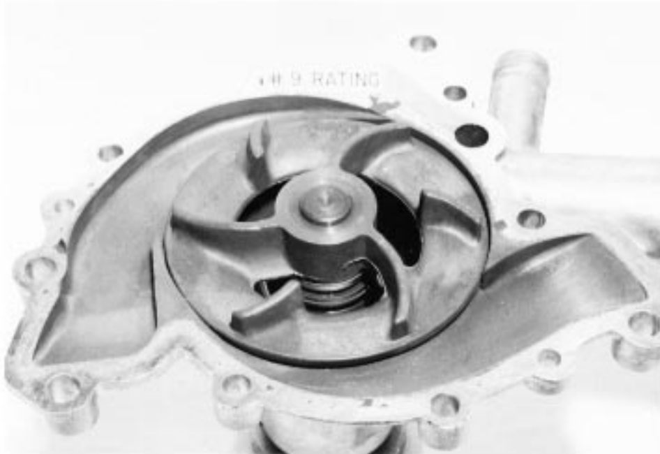
FIG. X1.4 Rating 9