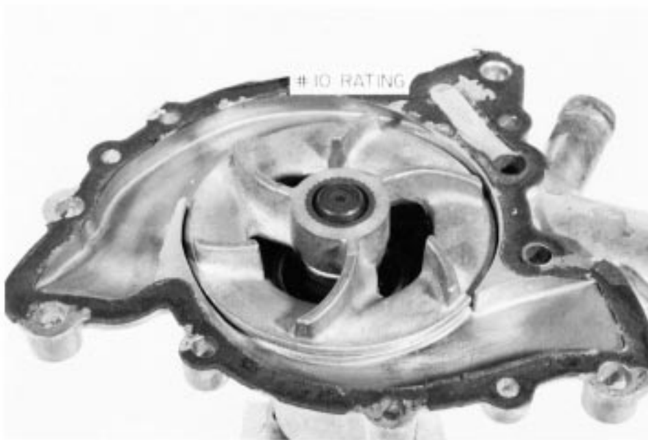
FIG. X1.5 Rating 10