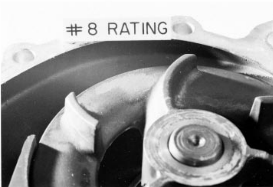
FIG. X1.3 Rating 8